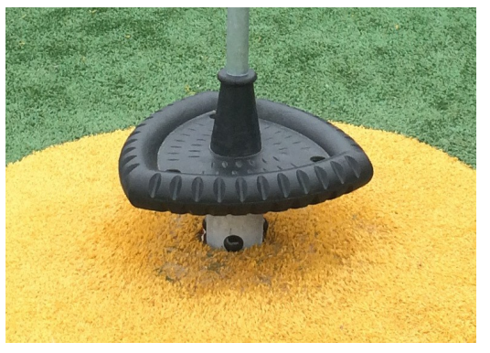
The unique GALAXY super triangle deck plate has an inner core of galvanised steel and soft outer layer of PUR rubber. The rounded edges has a non-skid pattern for safe play.