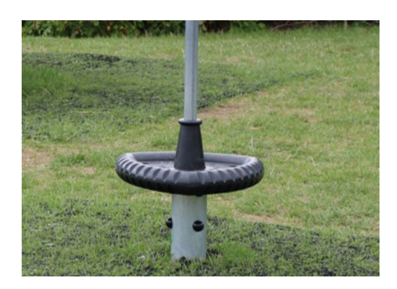
The steel surfaces are hot dip galvanised inside and outside with lead free zinc. The galvanisation has excellent corrosion resistance in outside environments and requires low maintenance.