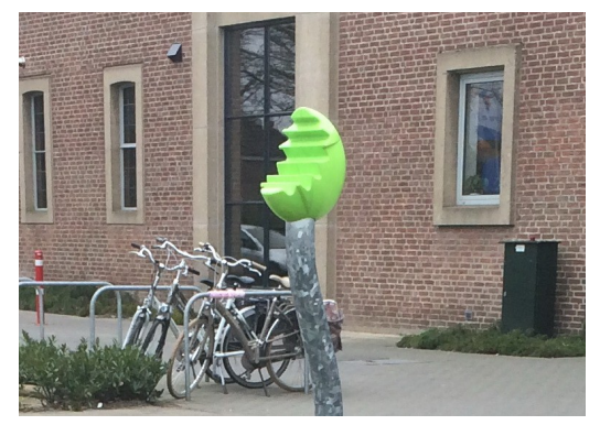
The coloured top is made of injection moulded high quality nylon (PA6) which is UV stabilised to ensure long life time. The two component design is assembled with steel pins around the steel pipe.