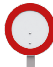
2606 DIVIETO DI TRANSITO