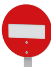
2609 DIVIETO DI ACCESSO