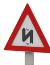
2605 CURVA DOPPIA