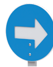
2612 DIREZIONE OBBLIGATORIA