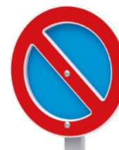
2611 DIVIETO DI SOSTA