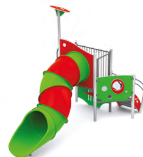
anodized aluminium poles version available